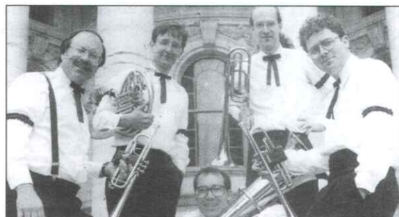
The Madison Brass

Sponsored By: Heritage Days - Village of Stratford (in the event of rain - to be held on Sunday evening)