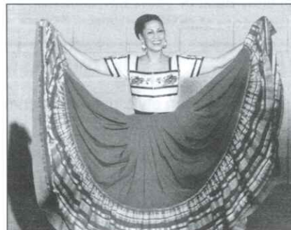
Ballet Folklorico Mexico

8:00 p.m. Sunday in Beer Tent Jackpot Tickets available for $20.00 with $1,000 1st prize (only 325 tickets sold) Heritage Days raffle tickets for $1.00 with $750 1st prize, and other cash prizes. Tickets available at the Information Booth.